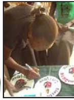
South Sudan Elections: A Learning Process (Page 2)