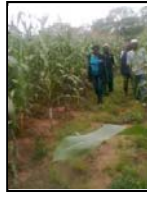
Mozambique: Providing New Avenues for Crop management (Page 3)