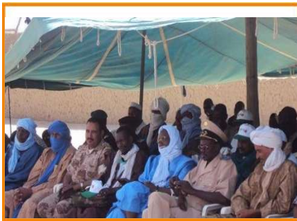
The Léré deputy district commissioner and other distinguished guest at the opening

The eagerly awaited dairy plant for local communities in Léré, located in the north of Mali, was officially opened on 25 February 2010. Léré is a pastoralist area which runs short of milk during the dry season due to lack of pasture for cattle. Now with the dairy plant the local population can benefit from daily supply of high quality fresh milk.