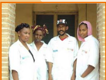
Dairy plant operators taking a break