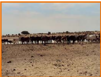
A herd of Zebu cattle in Léré

70% of milk sold is pasteurized and the rest is processed into yogurt and traditional milk curds called "féné".