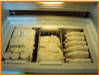
Milk products include pasteurised, fermented and yoghurt milk

70% of milk sold is pasteurized and the rest is processed into yogurt and traditional milk curds called "féné".