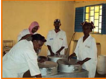
Dairy plant operators performing milk preservation techniques at Léré