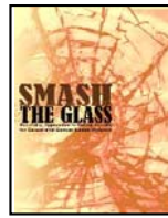
Publication: Smash The Glass - Redefining Approaches to ending Impunity on Sexual and Gender Based Violence (Page 4)