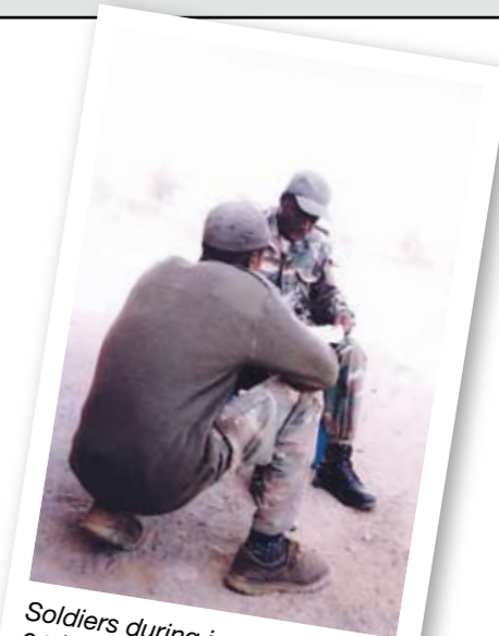
Soldiers during impact survey, 21 st Battalion, Matala, Angola