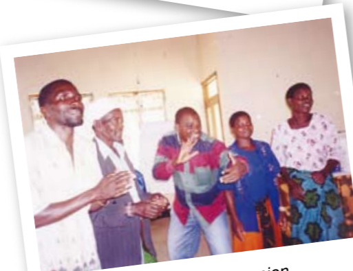
Mwanza Stepping Stones session