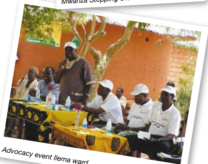
Advocacy event Ilema ward