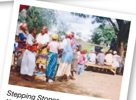
Stepping Stones session in Kanjanguite, Angola