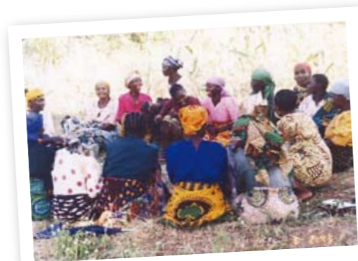
Mwanza Stepping Stones session

The establishment of an Advisory Committee bringing together project partners, service providers, policy makers and community representatives encouraged strong collaboration between SS project and partners in complementing social services and has led to some concrete improvements in the services provided. However, while poverty persists, HIV/AIDS vulnerability will remain acute.