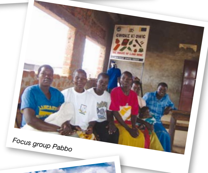
Focus group Pabbo